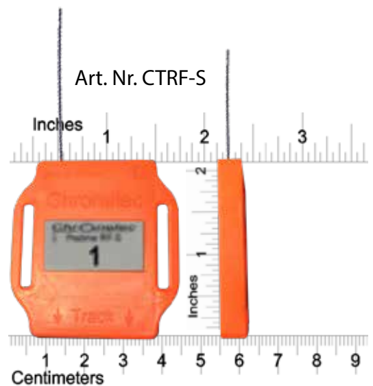
Art. Nr. CTRF-S